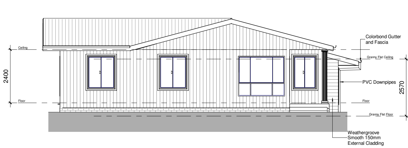
2 East Elevation 1 : 100