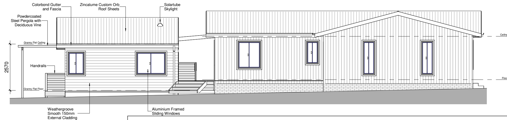
4 South Elevation 1 : 100