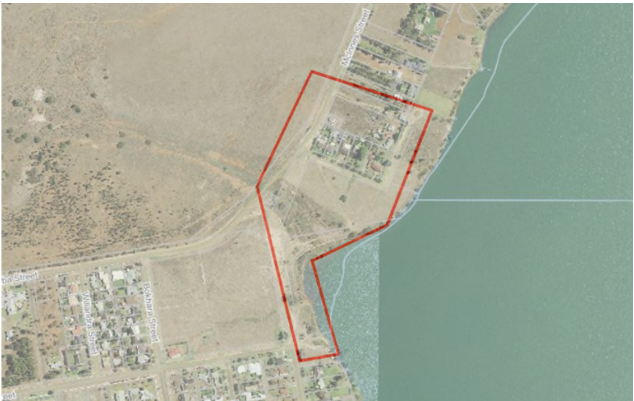
Lake Cargelligo – McInnes and Townsend Streets