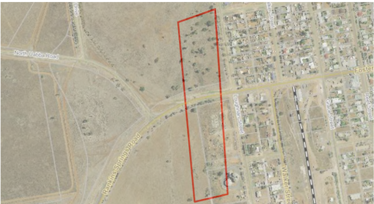
Lake Cargelligo – Loughnan Street and Rankin Springs Road