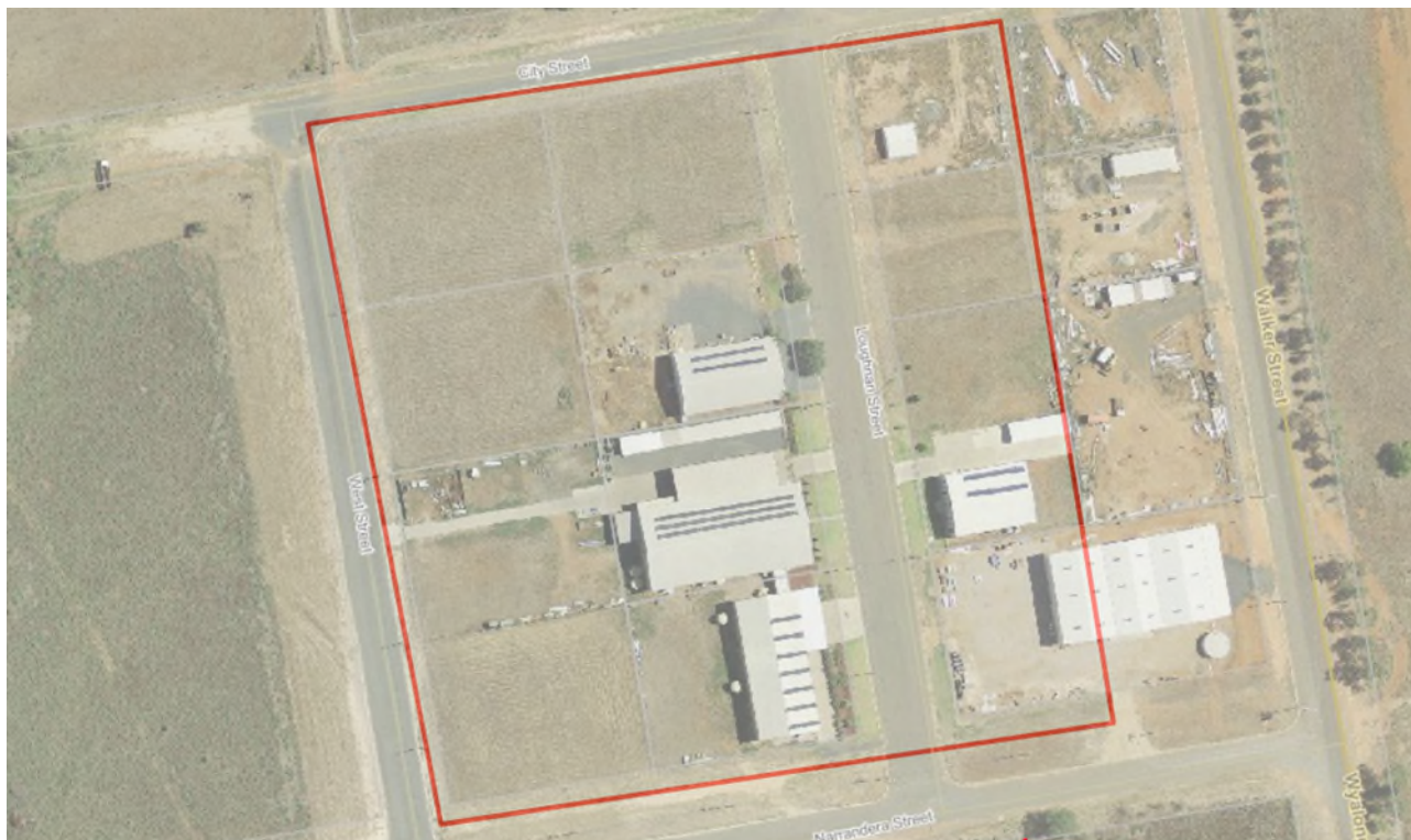
Lake Cargelligo – West, City, Narrandera and Loughnan Streets