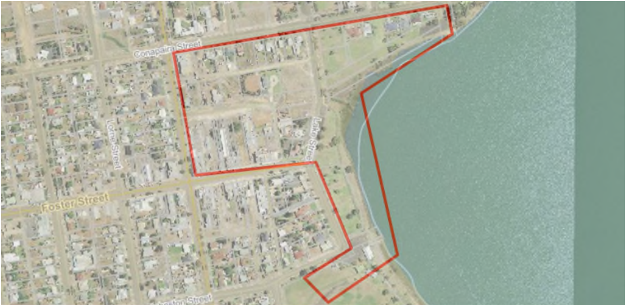
Lake Cargelligo – Conapaira, Canada, Foster, Bridge, Lake and Johnston Streets