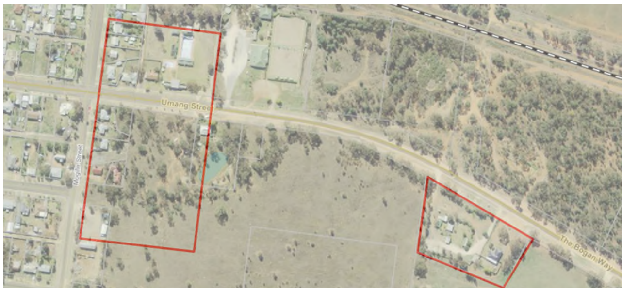
Tottenham – Mogille and Umang Streets, The Bogan Way