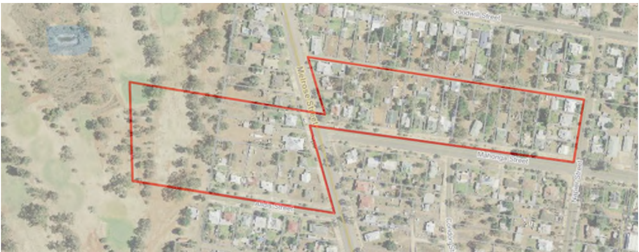
Condobolin – Alldis, Mahonga and Melrose Streets