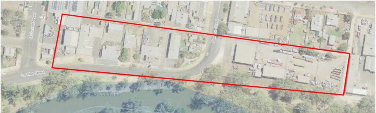
Condobolin – Denison and Lachlan Streets