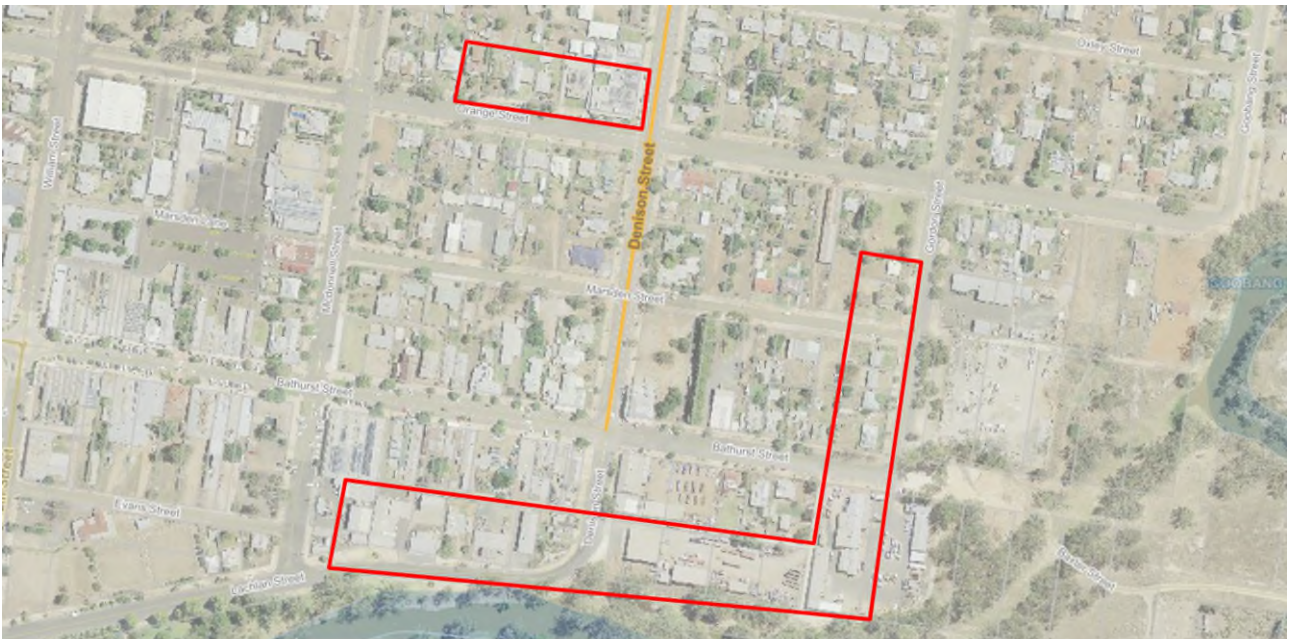
Condobolin – Orange, Gordon, Denison and Lachlan Streets